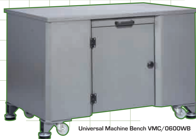
Universal Machine Bench VMC/0600WB

Shown with optional computer support extension. (Machine & PC not included)