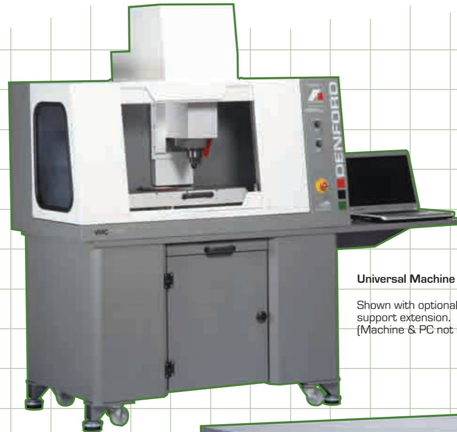
Universal Machine Bench VMC/0600B

Weight: 103kg - 227.08lbs (with integrated dust extraction unit 163kg - 359.35lbs)