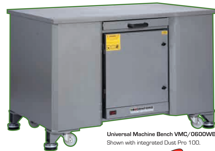
Universal Machine Bench VMC/0600WB