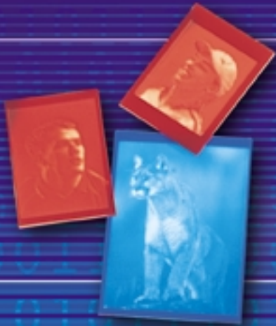
Image Relief brings digital photographs and scanned images to life by using a simple wizard to produce a hologram-type 3D image in thin plastic material, in conjunction with CNC machines, other CAM equipment or engraving machines capable of simultaneous 3-axis linear movement. Developed specifically to assist the teaching and enjoyment of CAD/CAM in education, Image Relief is equally appropriate for use by commercial engravers working in the novelty or decorative glass markets.